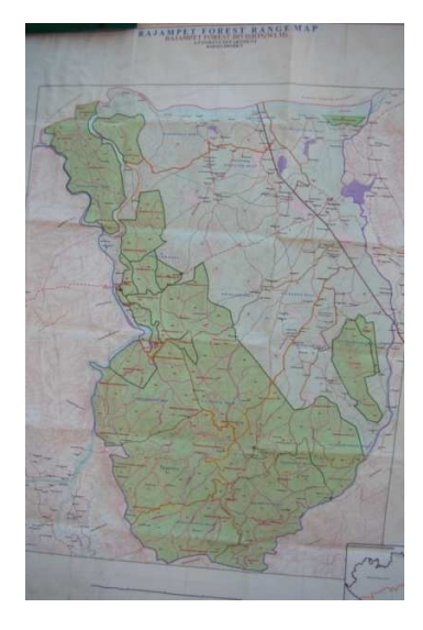
Map 2 showing Rajampet forest range and various beats and compartments